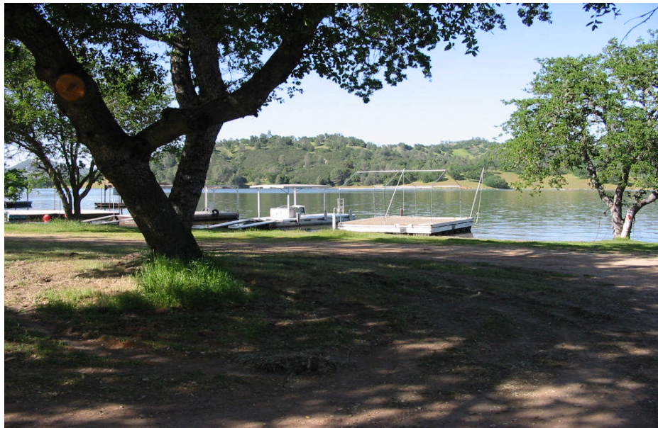
May 9, 2006 The Point is about 80% under water